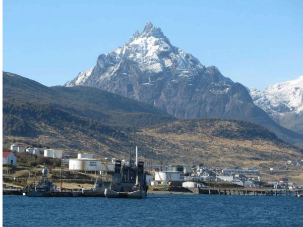
End of the World signboard at Ushuaia / Mount Olivia dominating Ushuaia

Day 11 El Chalten 17 Mar We fly from Ushuaia with Aerolineas Argentinas about 1.5hr, arriving El Calafate airport . We use chartered transport to travel north to El Chalten 200km 3hr. Rest of stay free to relax and enjoy the views of Mount Fitz Roy jagged peaks. O/N El Chalten for next 2 nights