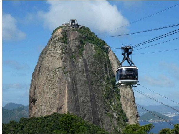
Selaron Steps / Sugarloaf or Pao de Acucar

Day 5 Fly Fox Iguacu Brazil and Puerto Iguazu 11 Mar Early morning flight GOL Airlines 2hr to Brazil's Fox Iguacu Airport. We transfer by chartered transport 15min to nearby Brazil Iguacu National Park. We also visit the nearby Parque das Aves Bird Park, home to many colourful birds which includes a humming bird aviary. By late afternoon, we cross border into Argentina by chartered transport for our overnight stay in Puerto Iguazu. O/N Puerto Iguazu ( Iguacu Park Entrance 2026 BRL131, Bird Park entrance 2026 BRL110, and transfers are covered ). Option for members to take the Gran Aventura 2hr boat ride where one is guaranteed to get wet.