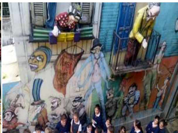
La Boca with its colourful murals & houses

Day 9 Fly Ushuaia 15 Mar Early morning flight about 3.5hr with Aerolineas Argentinas to Ushuaia. Ushuaia is the jumping off holiday town for Antarctica Cruises and also known as the 'End of the World'. Time permitting, members can opt for one of many boat tours along the Beagle Channel starting 4PM at own costs. O/N Ushuaia for next 2 nights