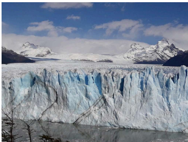
Mountainscape at El Chalten / Perito Moreno Glacier width 5km length 30km

Day 14 Puerto Natales (Chile) 20 Mar We take the morning public bus 6hr to Puerto Natales crossing into Chile Patagonia. Immigration is strict here, so NO fresh items inside baggages. It is the gateway to Torres del Paine National Park. Free rest of day to wander this small pretty town overlooking the Señoret Channel. This small town was founded back in 1911 for sheep ranching. O/N Puerto Natales Chile guesthouse for next 2 nights, simple breakfasts included.